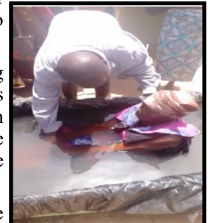
Baptism done in a Moveable Baptistery