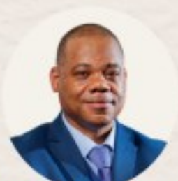
Kenney Johnson Minister